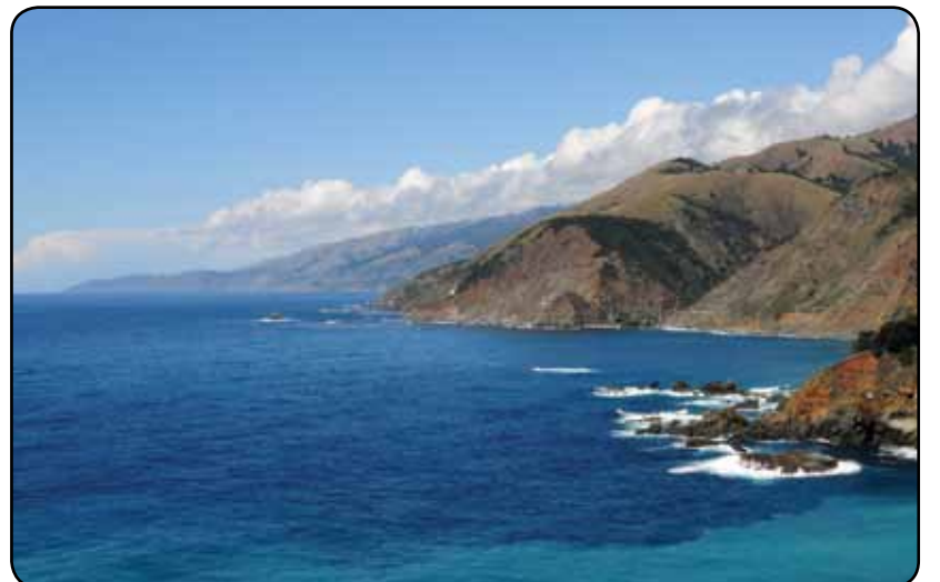
Big Creek Bridge and Big Sur coastline