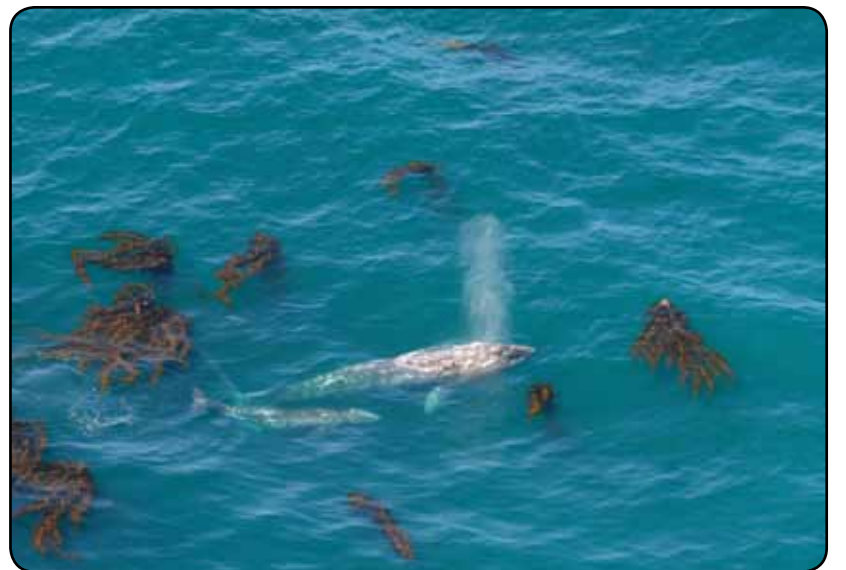
Gray whale and calf on annual migration to Alaska