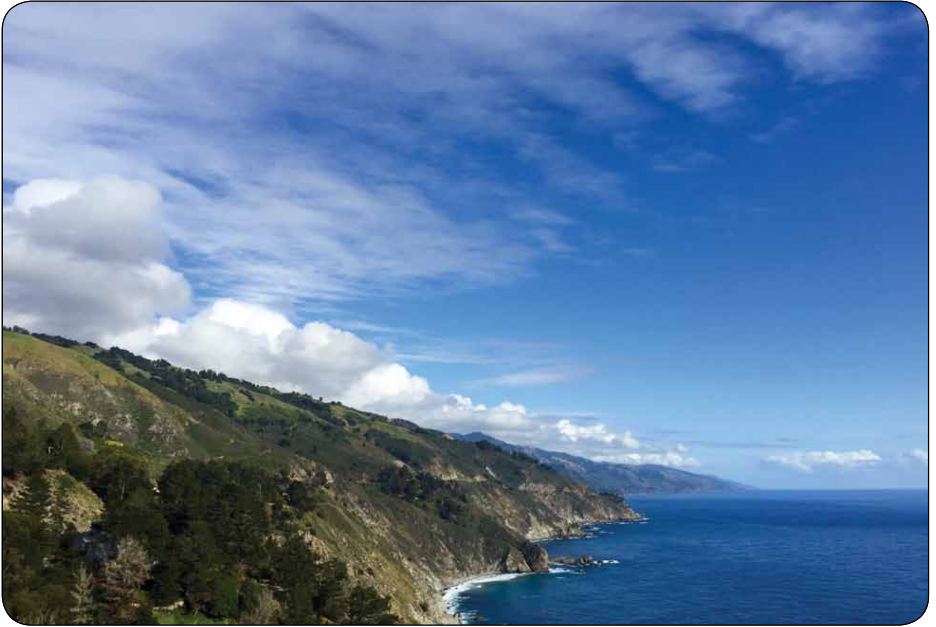
Big Sur Coastline ~ Partington Point