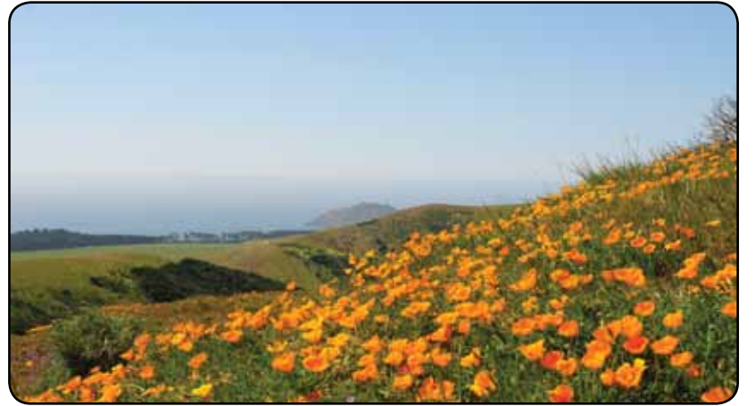
California poppies. Old Coast Road to Point Sur