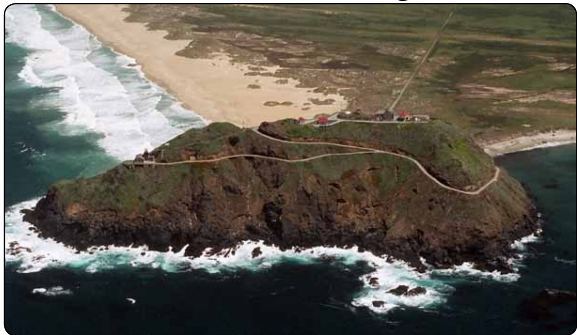
Point Sur Light Station

For information regarding guided tours, check the interpretive notices posted in the state parks, or call (831) 625-4419 for more information. Trained volunteer docents provide an informative and pleasurable tour to the visiting public, and provide access to the Point Sur Lightstation. Visit us on the web at www.pointsur.org