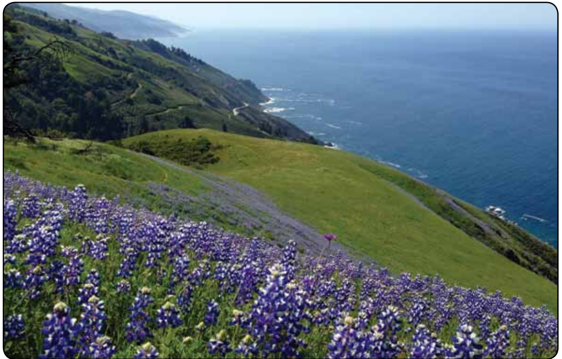
Lupine wildflower bloom on the Baronda Trail