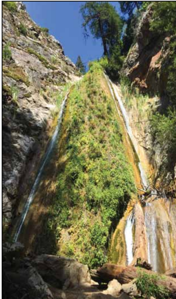
Limekiln Falls, Limekiln State Park

ANDREW MOLERA STATE PARK — Located 23 miles south of Carmel, Andrew Molera State Park is the largest State Park on the Big Sur Coast. A wide, scenic, mile-long path leads to a sandy beach that is sheltered from the wind by a large bluff to