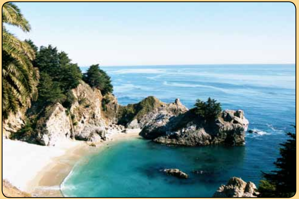
McWay Falls, Julia Pfeiffer Burns State Park