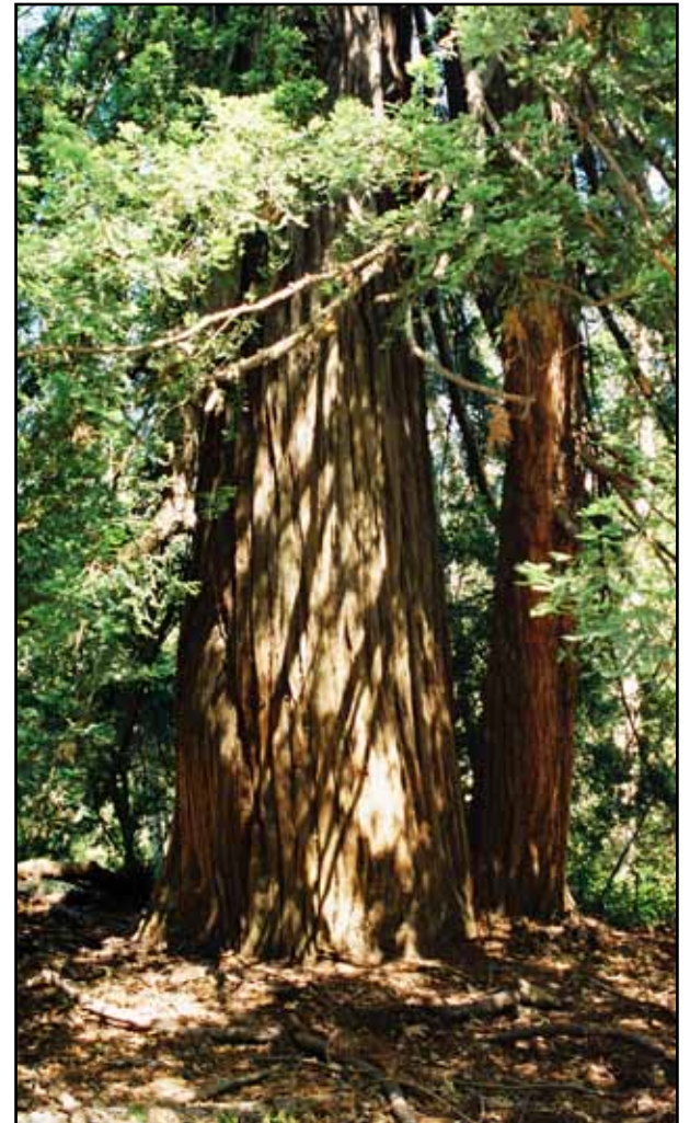
1,100 year old Colonial Redwood tree in Pfeiffer Big Sur State State Park