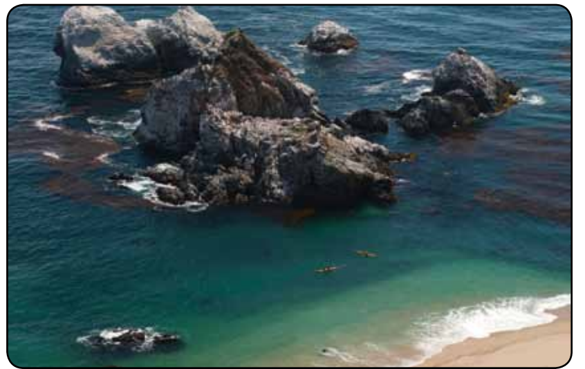
McWay Rocks & kayakers, JP Burns State Park

Evenings offer the opportunity to dine in restaurants from fanciful to exquisite. Relax in lodging that ranges from rustic to ultra-luxurious. Camp out in the many well equipped campgrounds. Luxuriate at the health spas. And of course, one of the favorite ways to pass the time in Big Sur is to simply Do Nothing .