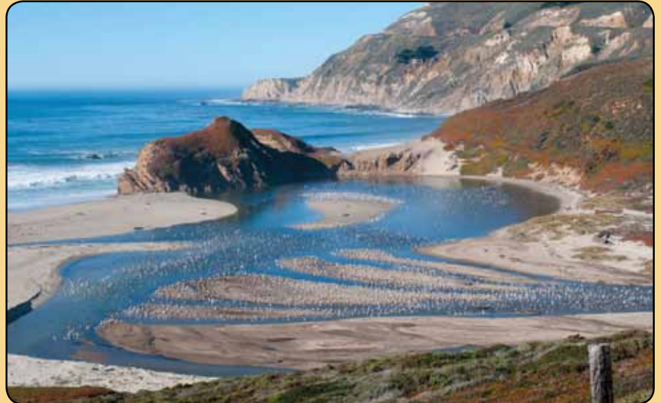
Little Sur River