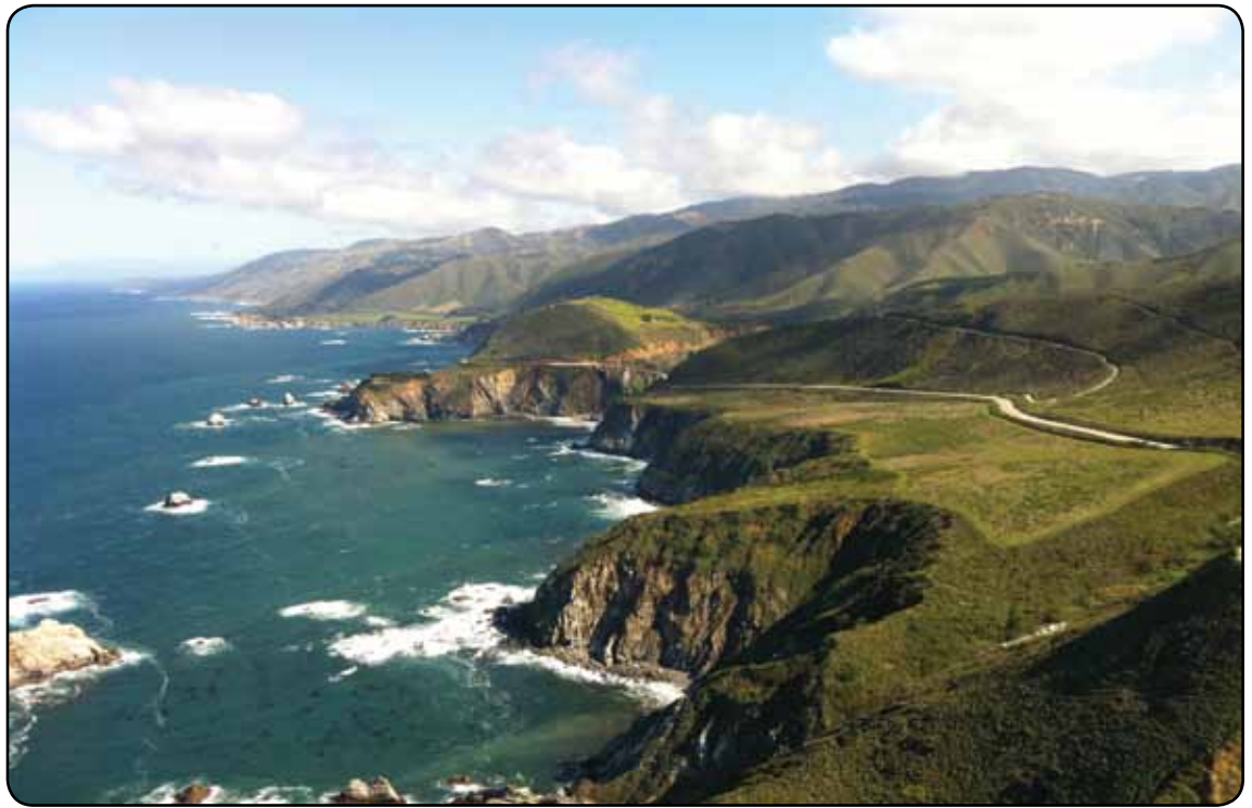
Bixby Bridge from Hurricane Point

www.mst.org 1-888-MST-BUS1 (1-888-678-2871)