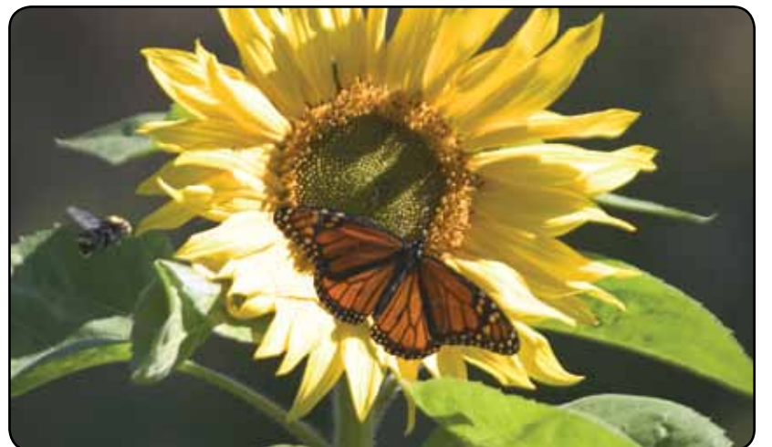
Monarch butterfly on its annual migration