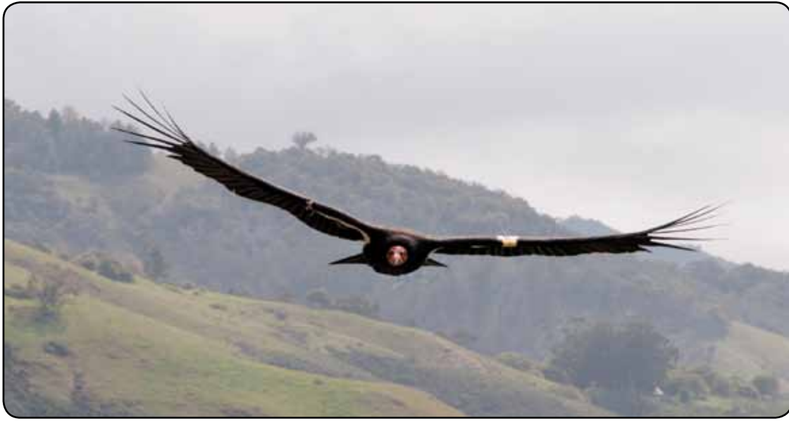
Rare California Condor in flight (9.5 ft wingspan)