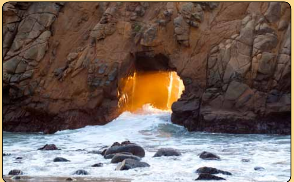
Pfeiffer Beach Sunset