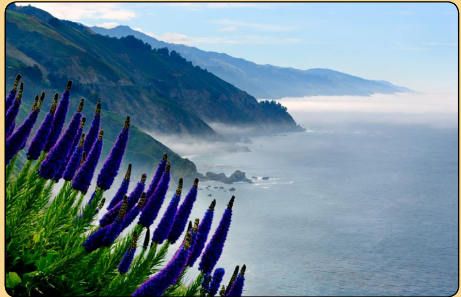
Photograph by Brock Bradford