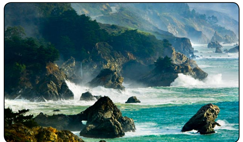
McWay Falls, Julia Pfeiffer Burns State Park