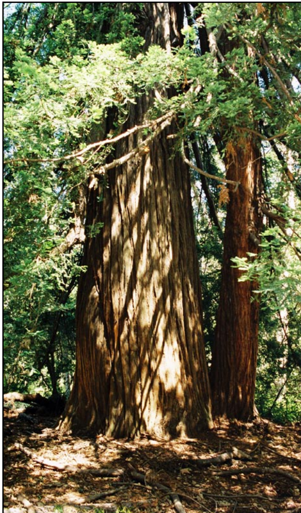
1,100 year old Colonial Tree in Pfeiffer Big Sur State State Park

Adjacent to the softball field at Pfeiffer Big Sur State Park is one of Big Sur's largest redwood trees. The size of this ancient tree, known locally as the "Colonial Tree," is deceiving — due to lightning strikes, this majestic specimen's top has been severed.