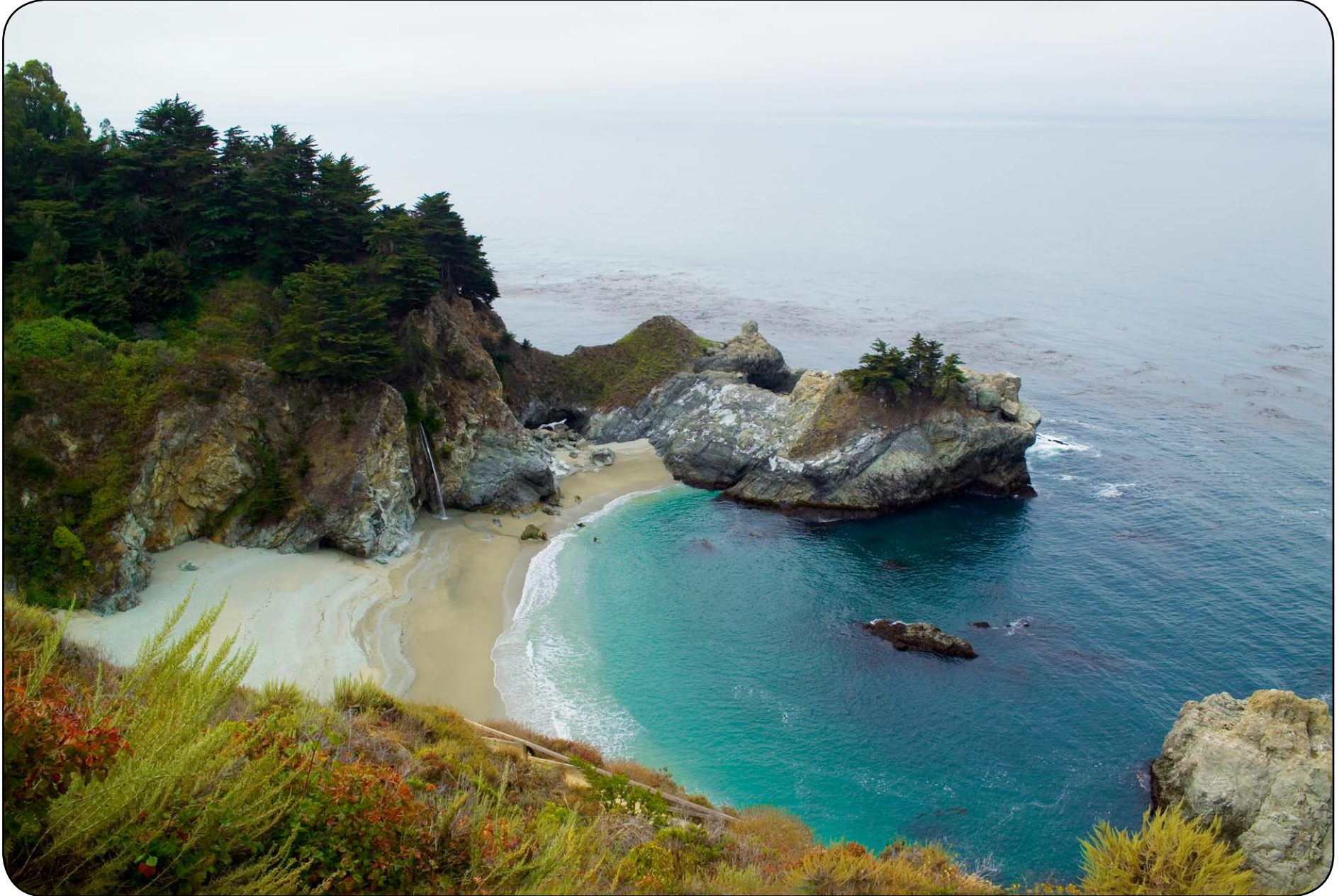
Julia Pfeiffer Burns State Park and McWay Falls