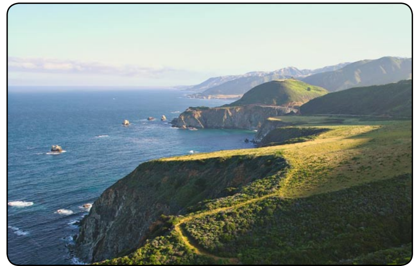
Bixby Bridge from Hurricane Point

That's right. Relax and take in the magnificent beauty of Big Sur. Once you are here there is no reason to do anything more. Replenish your spirit by simply absorbing the weepingly beautiful vistas of Big Sur. Do Nothing in Big Sur and leave refreshed and