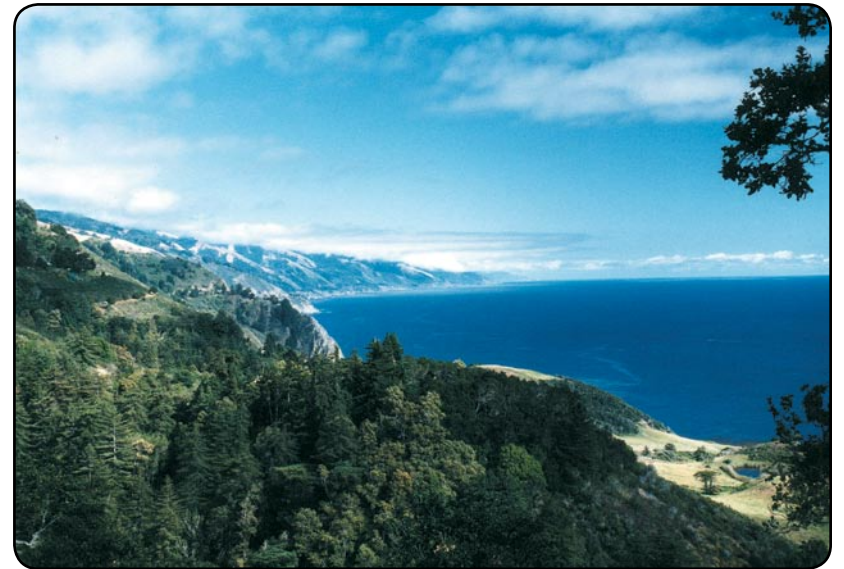
Big Sur Coastline