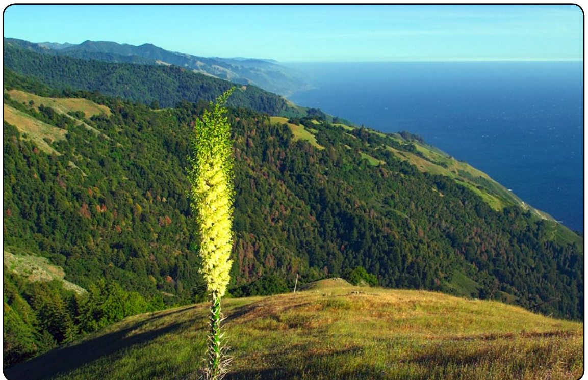
Big Sur coast