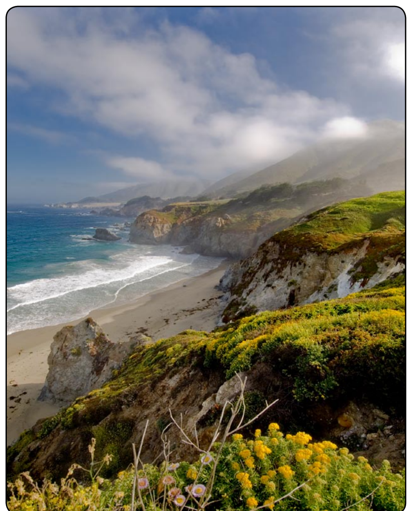
Rocky Creek photo; Brock Bradford