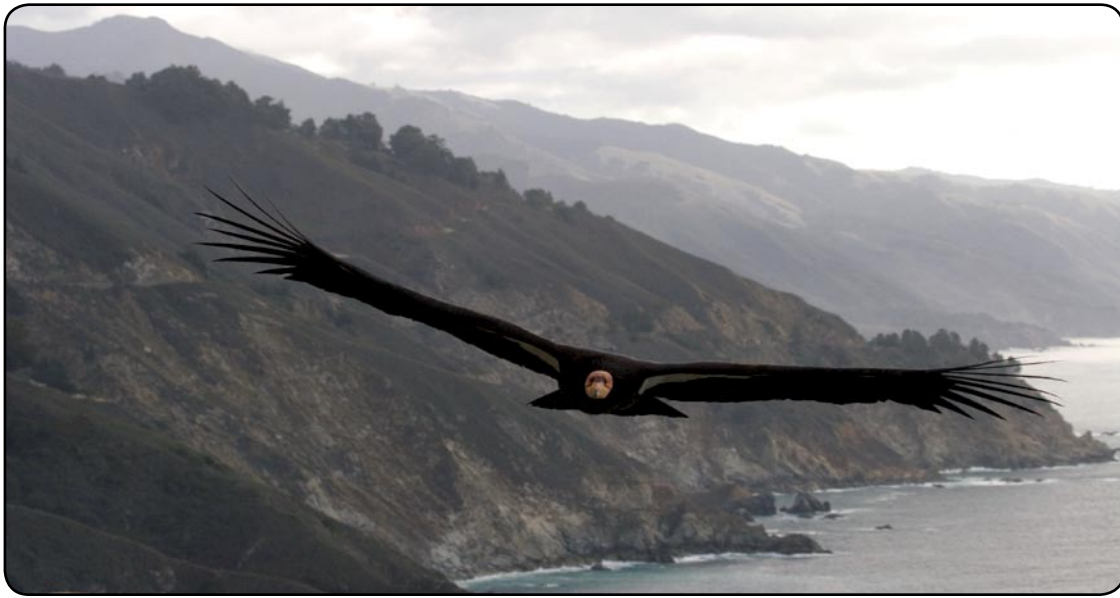
California Condor in Flight